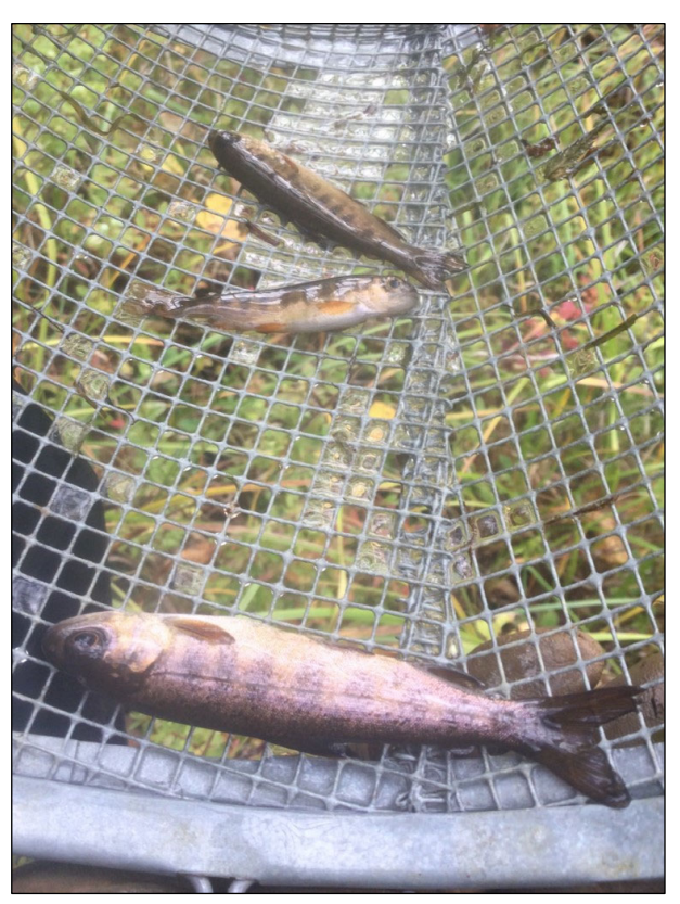
Figure 1.—Juvenile coho salmon captured at waypoint 1854.